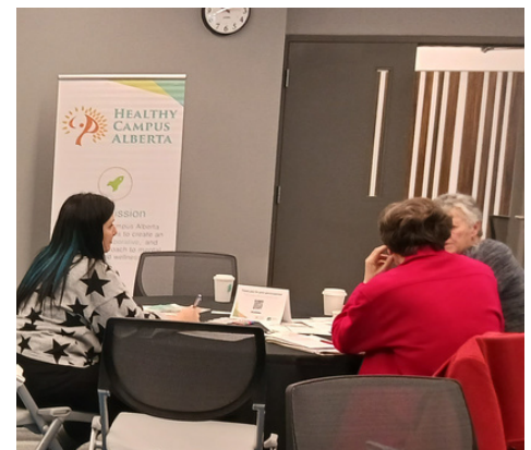
Photograph of participants engaged in discussion.